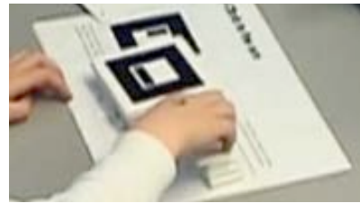
Figure 3. Building a tower with the paddles

They start to discuss in which order the animals are on the tower and which orders they already tried. Again, the tower tumbles and they have to start all over. Clara takes the paddle with Crab, waves it around, but doing so occludes the marker on the sheet with her paddle. Alice now tells her to "push him down", and takes her hand, tilting hand and paddle so the paddle faces downward (see figure 4, right).