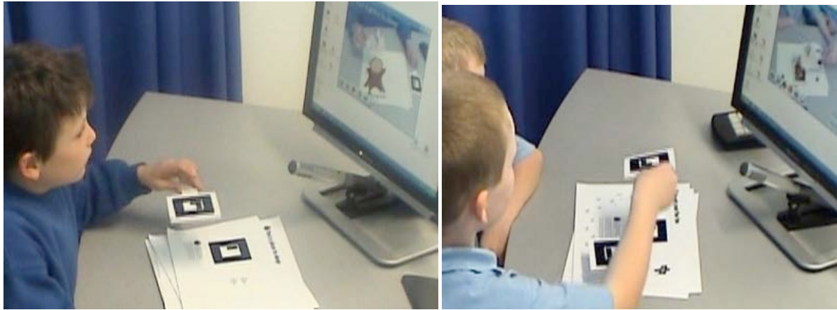
Figure 2 Trying to sit on top of the tree trunk and attempting to ‘jump over’ the fox

size and orientation are tracked and the digital objects (which on-screen are overlaid on the markers) are shown in the corresponding perspective view. Yet the story engine, that determines the effects of interaction, interprets the position of optical markers as a 2D point in the camera picture, ignoring orientation and height. A further limitation of the system is that markers need to be visible and paddles carry markers only on one side. Occlusion results in the virtual object disappearing. Objects can thus not be turned upside down.