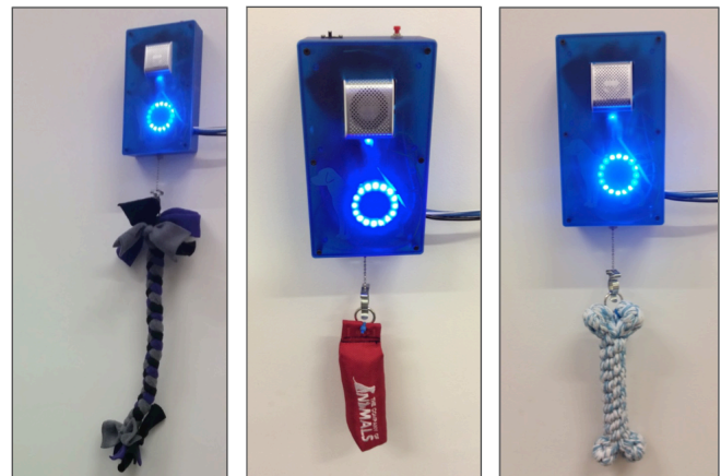
Figure 2. A canine alarm prototype used to test with the dogs and their trainers (displayed with different canine attachments).

alarm, they would not be tempted to engage with the alarm unless they were triggered to do so by a verbal or behavioral cue. For example, rather than making a very inviting interface that the dog found easy and even pleasurable to use, we could design something more challenging so that they would not be tempted to use it for fun thus creating false alarms. However, this is also problematic as it could potentially backfire and result in the dog not being able to engage with the alarm during a real emergency. Thus, we decided to take different approach to handling false alarms, which was to add functionality that allowed the user a reasonable (configurable) amount of time to get to the alarm after the dog had triggered it to cancel it. Following from this, another requirement of the system emerged, namely the requirement that the alarm must make some sort of sound, so that if the dog triggered it whilst in another room the owner would be know that it had been triggered. We also realized that, if following a false alarm the owner could not get to the device in time to cancel it, their friends and family would be worried needlessly. We thus added a requirement that if the alarm was cancelled "too late" during a false alarm and texts had already been sent out, follow-up notification calls and texts would be sent to the emergency contacts.