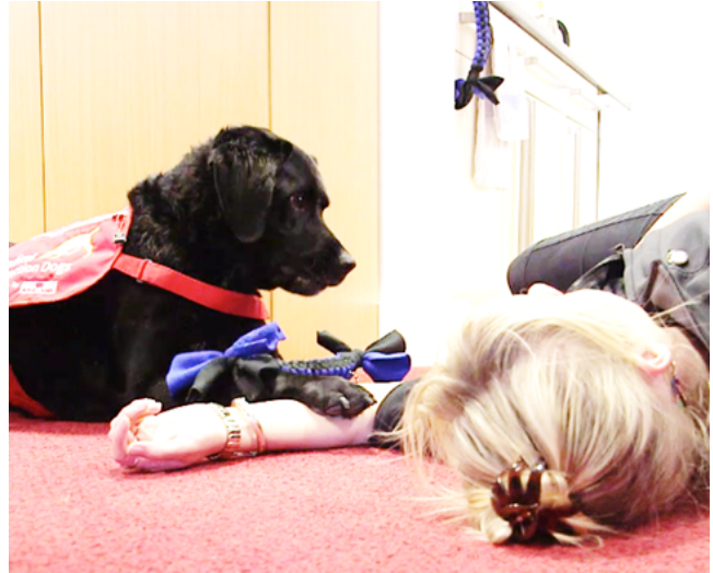
Figure 4. A tester dog returns the tuggy to her trainer who has "collapsed" in a training session to cue the dog to pull the tuggy off the alarm.

their own user perspective, for the purpose of training the dogs, independently of the perspective of the dogs. We were especially interested in understanding where these canine and human requirements overlapped, and whether any tensions existed between the two and, if so, what tradeoffs might need to be made.