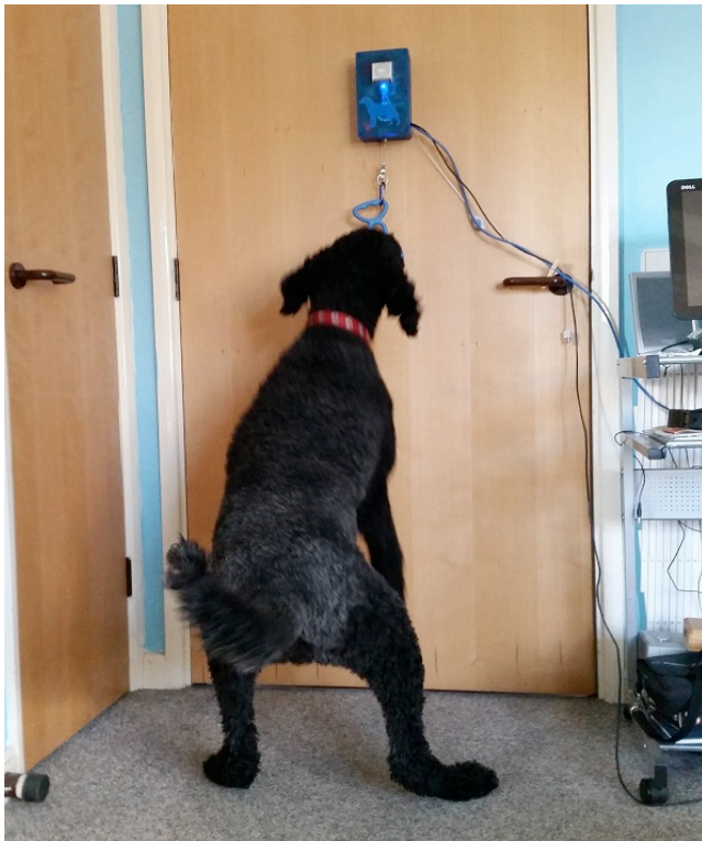
Figure 3. A tester dog triggering the alarm on command.

For each assistance dog and trainer partnership, we held testing and feedback sessions whereby the dog was encouraged to engage with the system with varying settings and with varying cues. We observed both spontaneous and instructed behavior in the dogs, and recorded feedback from the trainers interpreting the dog's actions and responses. The dog and trainer partnerships were presented with different iterations of the prototype across the span of several months.