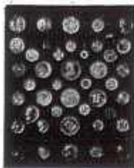
Medals awarded to Alfred West for Marine Photography.

AN ILLUSTRATED AND DESCRIPTIVE CATALOGUE.